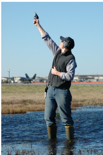
A Wildlife Services employee conducts a pyrotechnic dispersal at Langley Air Force Base in Virginia.

Many veterans have found work in WS to be a natural fit following their military careers or while serving in the reserves. WS officials know they have something attractive to offer Veterans—not just a career, but something that closely matches a unique skill set.