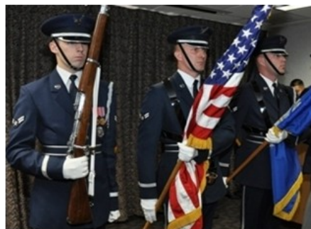
Military honor guards commence FNCS' Veterans Days ceremony.

FNS takes Cultural Transformation's "Recruitment and Retention" pillar, which calls upon agencies