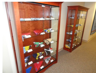
A display featuring flags and information from numerous Native American Tribes adorns the Mountain Plains Regional Office of USDA's Food and Nutrition Service in Denver.